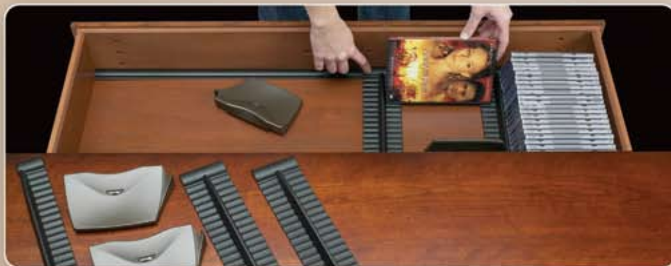
Rails easily adjust to any width media