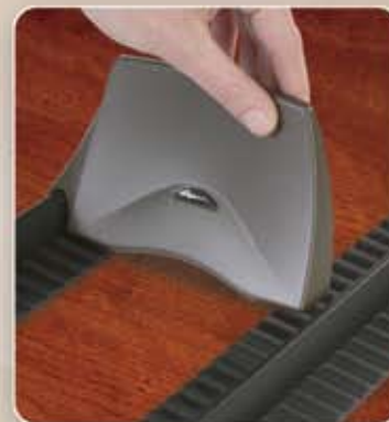
Pivot back support to adjust